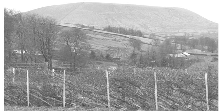
Hedgelaying under Pendle in 2019