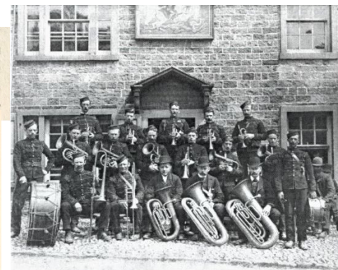
The Downham Band 1885 (outside the George & Dragon)

THE Members of the brass band have been holding their practices on the village green during the past month and very much has their music been appreciated by the admiring bystanders, "who, milking finished, loll pensive o'er the sigmoid bridge, where-under dart the spotted trout, etc." at least so writes our correspondent, and if the Downham Brass Band has induced any fish to wriggle its way through Chatburn it has indeed accomplished wonders that put Amphion and his "small plantations" into obscurity. But we can't believe there is a trout in Downham beck!